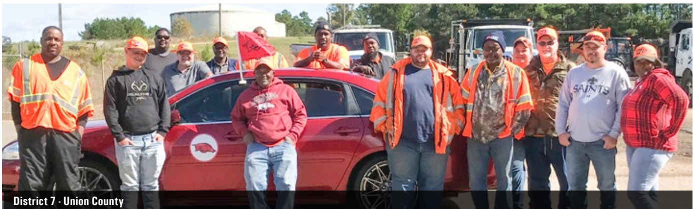
District 7 - Union County