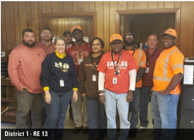
District 1 - RE 13