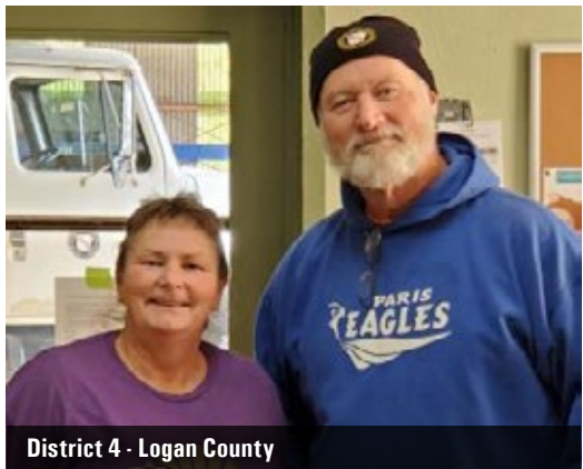
District 4 - Logan County