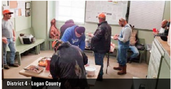
District 4 - Logan County