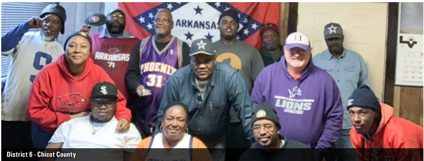
District 6 - Chicot County