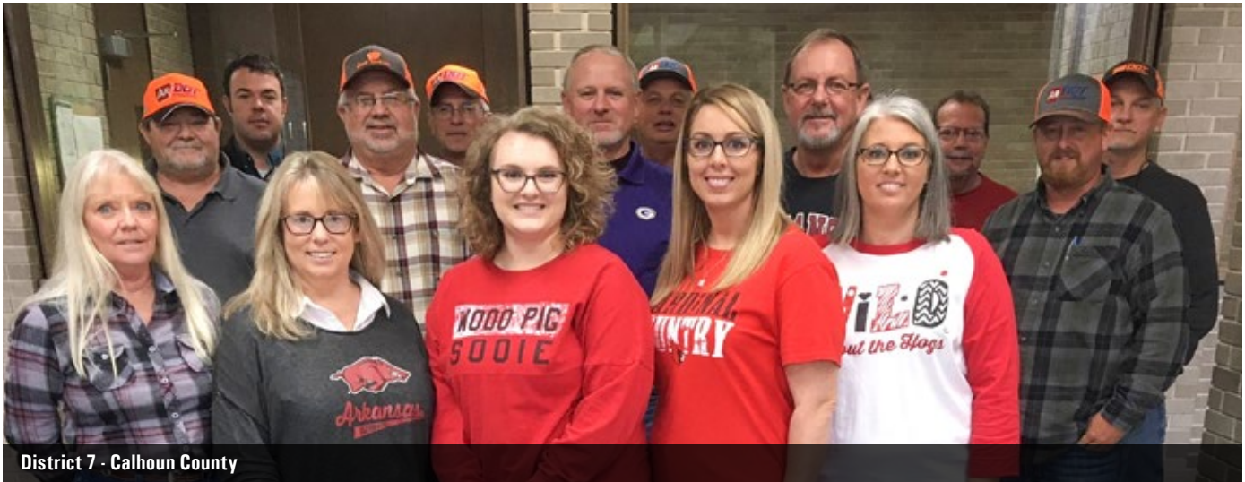
District 7 - Calhoun County