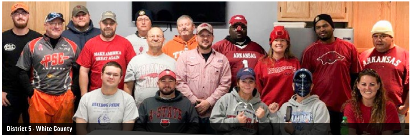
District 5 - White County