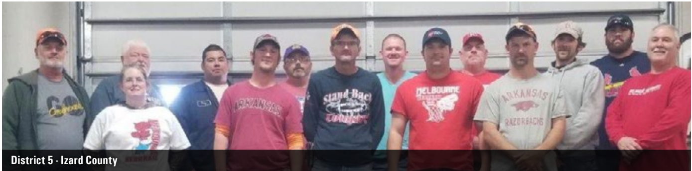
District 5 - Izard County