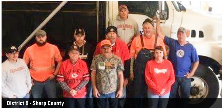
District 5 - Sharp County