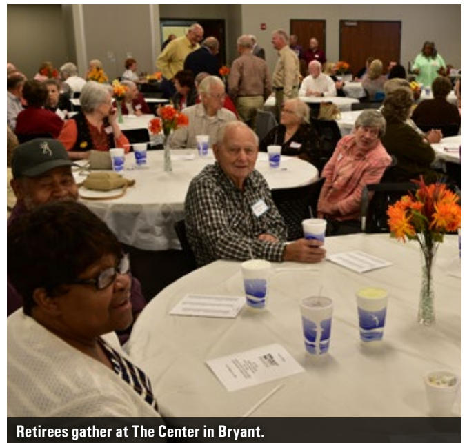
Retirees gather at The Center in Bryant.