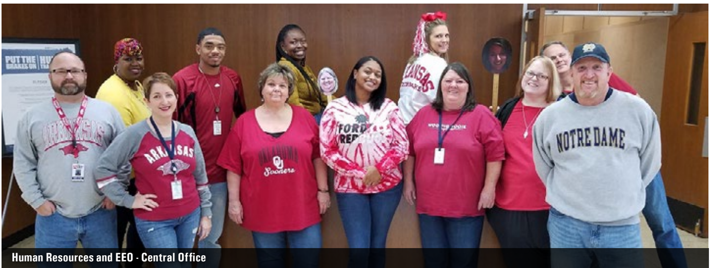
Human Resources and EEO - Central Office