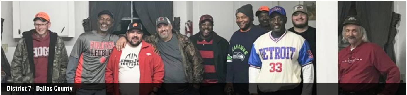
District 7 - Dallas County