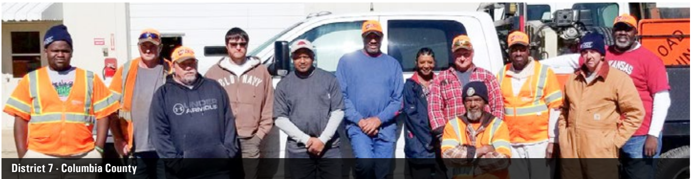
District 7 - Columbia County