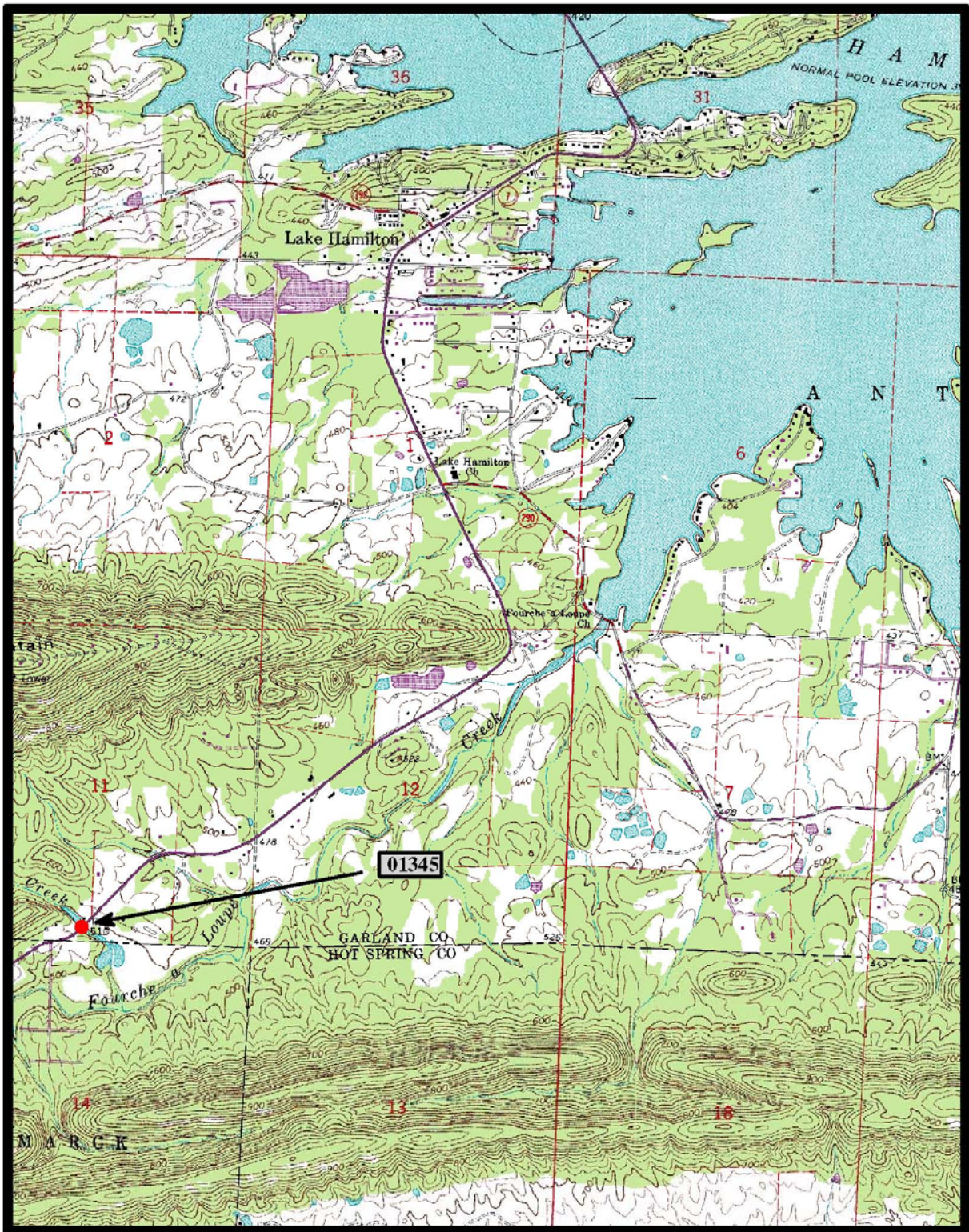
Hot Springs South 7.5 min. Quad