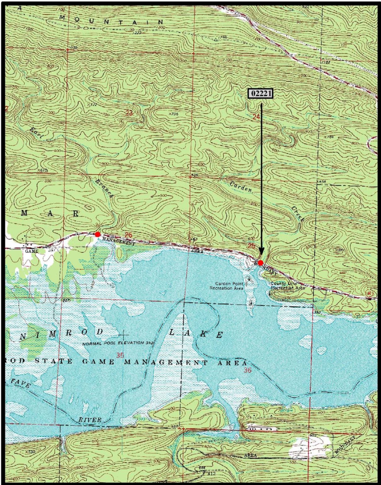
Nimrod Dam 7.5 min. Quad