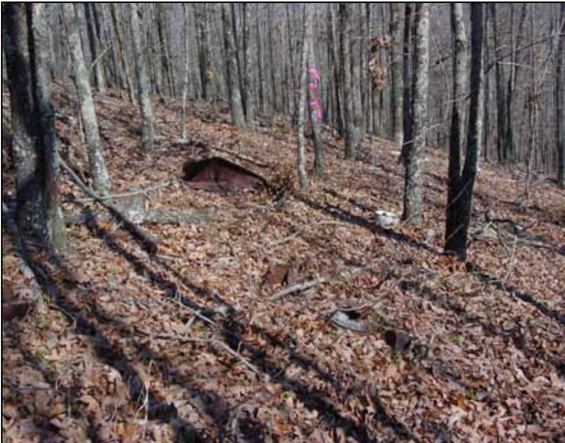
Figure H-5: Illegal dumping along Batesville Pike

Batesville Pike Illegal Dump - An illegal dump located parallel to Batesville Pike along the Preferred Alternative was found to contain old car parts, tires, and other metal household debris (see Figure H-5). This dump is approximately 50 feet (15 meters) wide and runs in a northeast-southwest tangent for a distance of 150 feet (46 meters) about 100 feet (30 meters) east of Batesville Pike. No sealed drums or hazardous waste containers were observed at the site. No age determination could be established for this site. The site was not in ADEQ's Solid Waste-Illegal Dumps records.