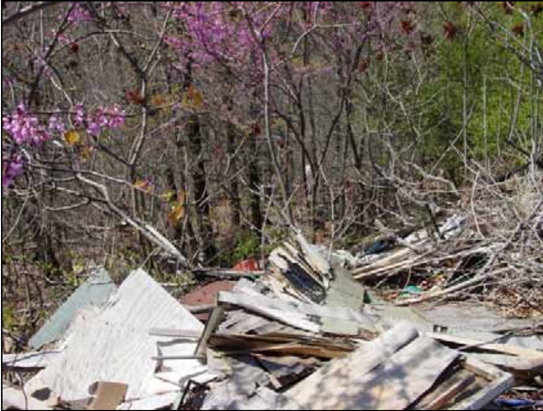
Figure H-1: Illegal dump on south side of Trapp Road

Abandoned Landfills North of Barracks Complex - A landfill which contains various unknown materials and substances was created in the early 1970s. The location of this landfill is just outside the Preferred Alternative, is shown on Figure 3.15-1 and Figure H-2, and is named Site 2C. The primary method of disposal in the landfill was pit and burial. The size of the landfill is approximately 17 acres (7 hectares) and currently has a brush and small pine tree cover. This landfill has been abandoned for approximately 14 years. The materials and substances deposited in the landfill are of unknown chemical and physical properties.