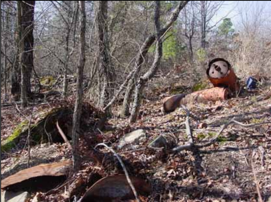
Figure H-4: Illegal dump near Batesville Pike