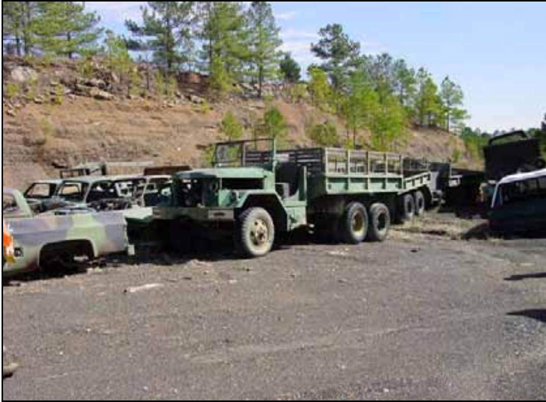
Figure H-3: Old military vehicle storage area