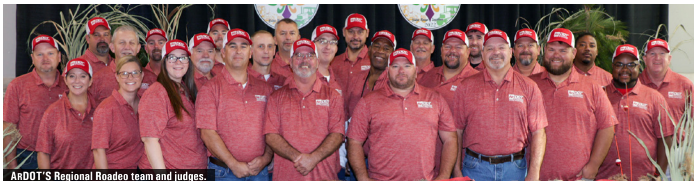
ARDOT'S Regional Rodeo team and judges.

Next year's event will be hosted by the West Virginia Department of Transportation. ♦