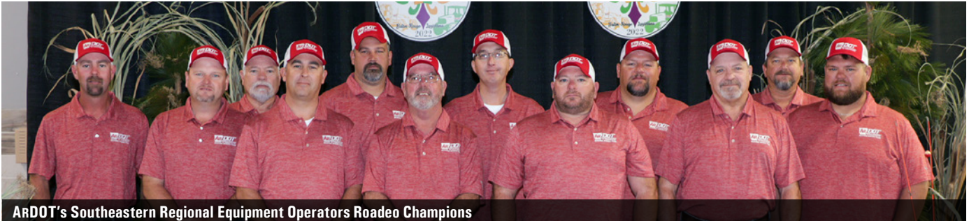
ARDOT's Southeastern Regional Equipment Operators Rodeo Champions

The 18 th Annual Southeastern Regional Equipment Operators Training Conference and Rodeo took place in early October and ARDOT came home as "Rodeo Champions" in the Rodeo competition.