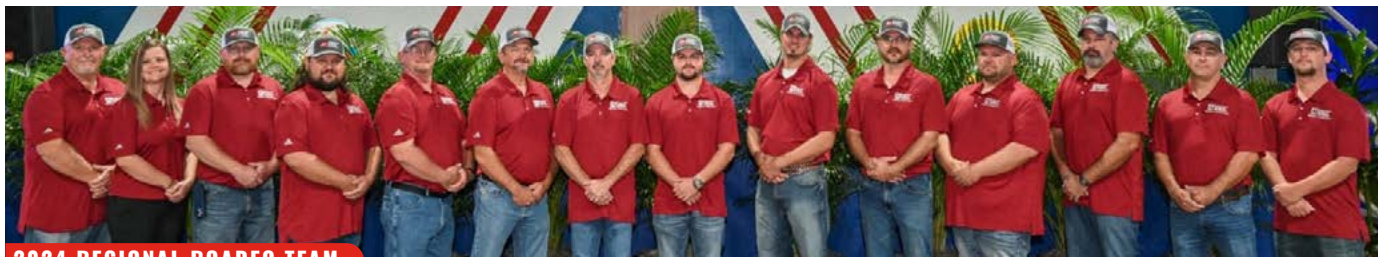
2024 REGIONAL ROADEO TEAM

In September 2024, a team composed of 14 of our most skilled equipment operators from nine ARDOT Districts traveled to Raleigh, North Carolina to represent Arkansas in competition against 11 other southeastern states at the 20 th Annual Southeastern Regional Equipment Operators Roadeo. These operators all represented ARDOT with class and persevered through a tough competition in rough weather conditions. That perseverance paid off for five of our employees who placed in the top three for their events!