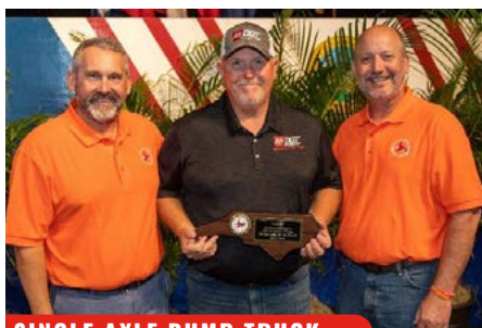
SINGLE AXLE DUMP TRUCK