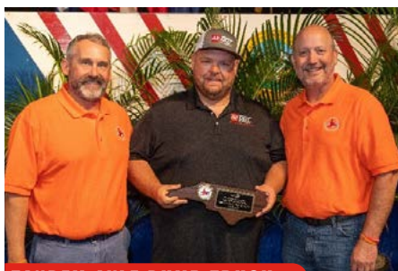
TANDEM AXLE DUMP TRUCK

In September 2024, a team composed of 14 of our most skilled equipment operators from nine ARDOT Districts traveled to Raleigh, North Carolina to represent Arkansas in competition against 11 other southeastern states at the 20 th Annual Southeastern Regional Equipment Operators Roadeo. These operators all represented ARDOT with class and persevered through a tough competition in rough weather conditions. That perseverance paid off for five of our employees who placed in the top three for their events!